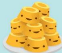
More kelp cakes