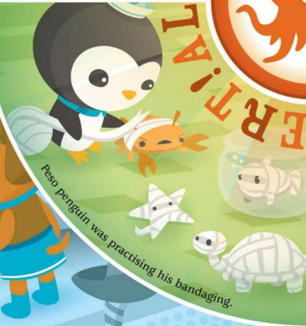
Peso penguin was practising his bandaging.