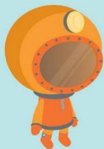
Deep-sea diving suits