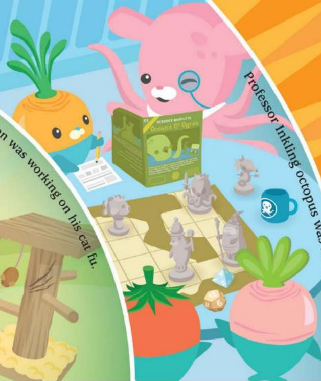
Professor Inkleling octopus was leading a game.