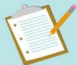
Pencil and paper