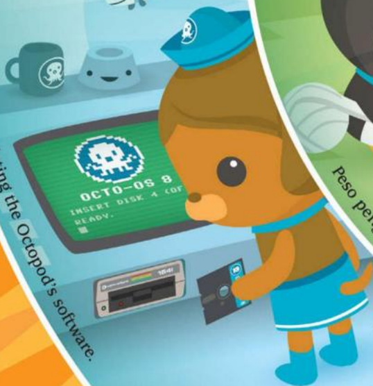
Dashi dog was updating the Octopod's software.