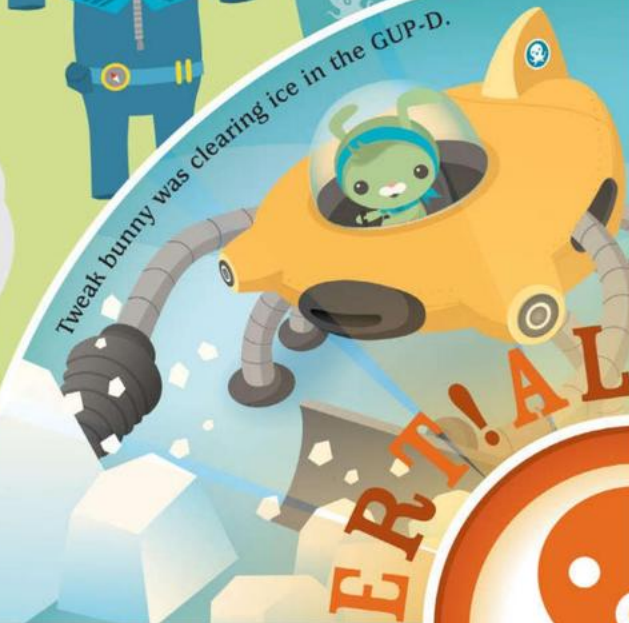
Tweak bunny was clearing ice in the GUP-D.